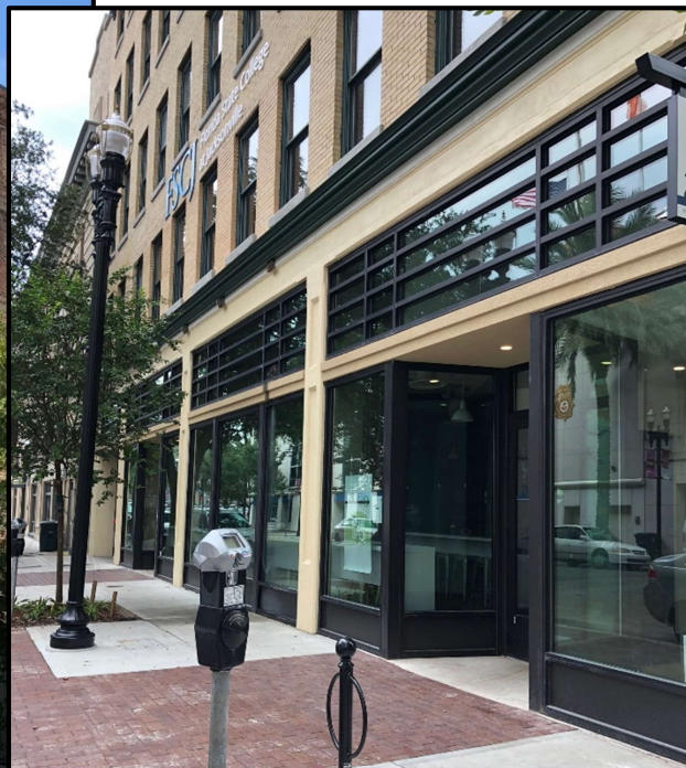
Storefront restoration based on historic plans