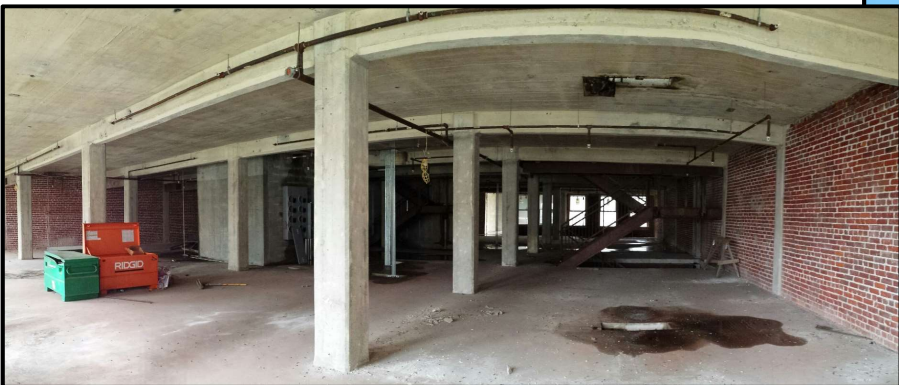
Vacant shell interior